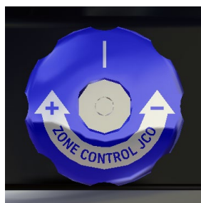
JCO (Jounce Cut-off) Adjuster