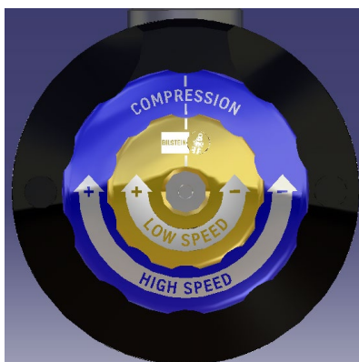
Dual Speed Reservoir Adjuster